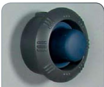
Monéo S & V

In addition, Fichet-Bauche carries its own lifecycle tests to ensure the long-term reliability of the product.